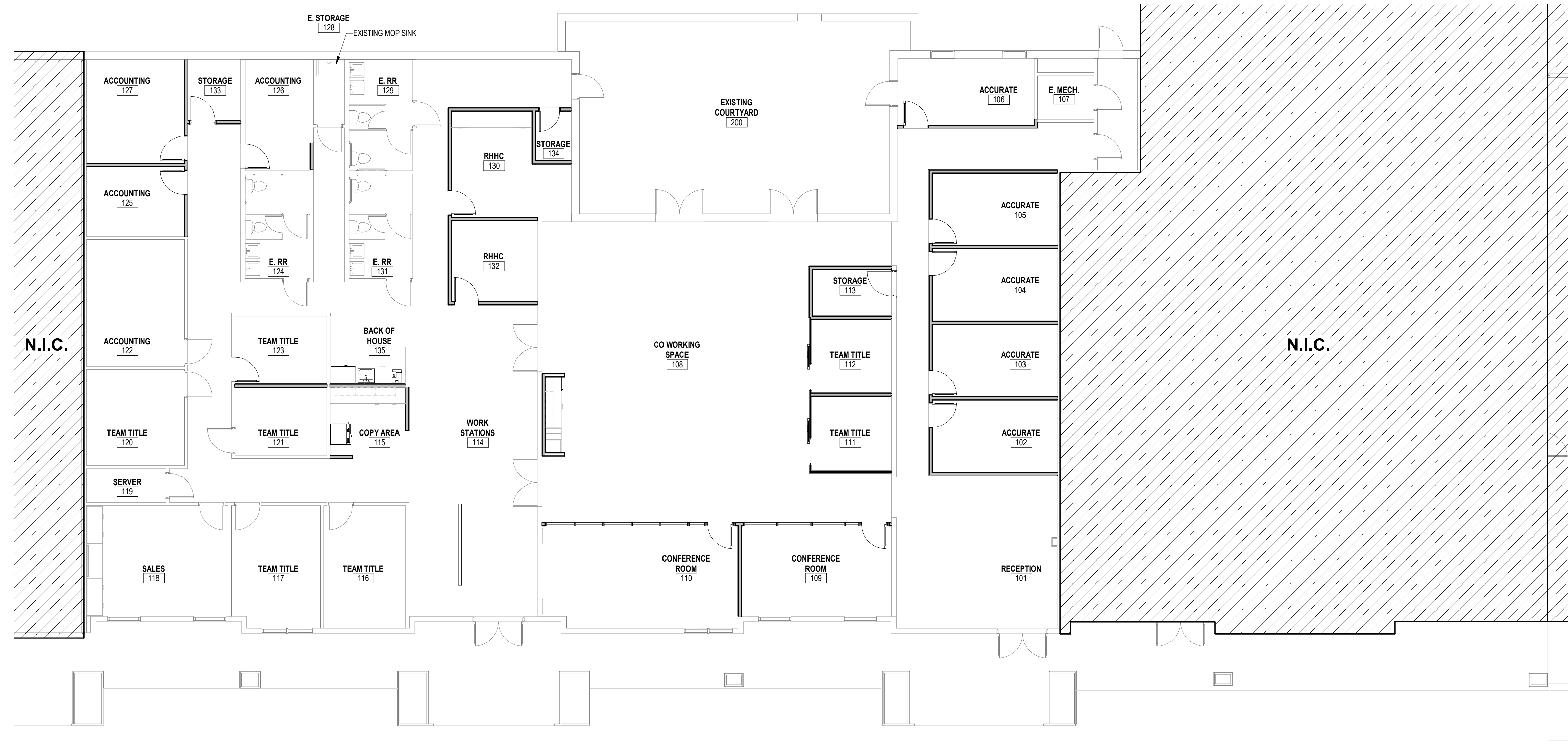
1 FLOOR PLAN A2.1 SCALE: 1/8" = 1'-0"